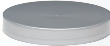
120-400 SM Smooth Side Wall Smooth Top Continuous Thread 120mm Diameter 400 Thread Profile Lined or Unlined