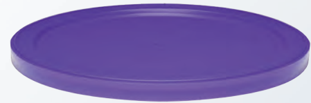
603 Snap Lid Smooth Side Wall Friction Fit 160mm Diameter