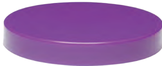
110-400 SM Smooth Side Wall Smooth Top Continuous Thread 110mm Diameter 400 Thread Profile Lined or Unlined