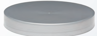
120-400 SM Smooth Side Wall Smooth Top Continuous Thread 120mm Diameter 400 Thread Profile Lined or Unlined