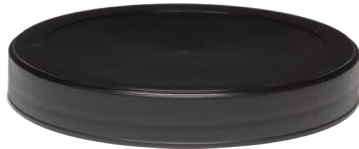
120-400 RB Ribbed Side Wall Matte Top Continuous Thread 120mm Diameter 400 Thread Profile Lined or Unlined