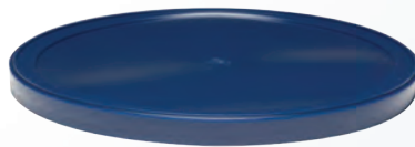
503 Snap Lid Smooth Side Wall Friction Fit 130mm Diameter