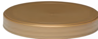
110-400 RB Ribbed Side Wall Matte Top Continuous Thread 110mm Diameter 400 Thread Profile Lined or Unlined